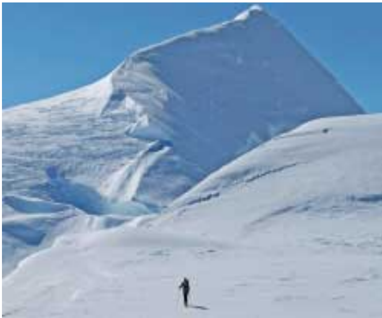
Greenland is covered in ice and snow. ( http://www.seed.slb.com/labcontent.aspx?id=33530&terms=sea+ice+and+glaciers )