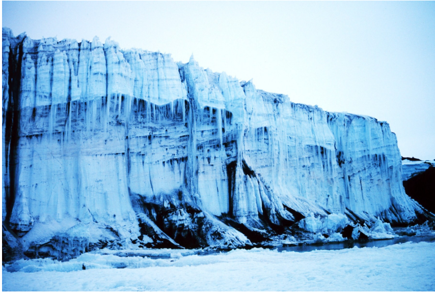
The front of a melting glacier.