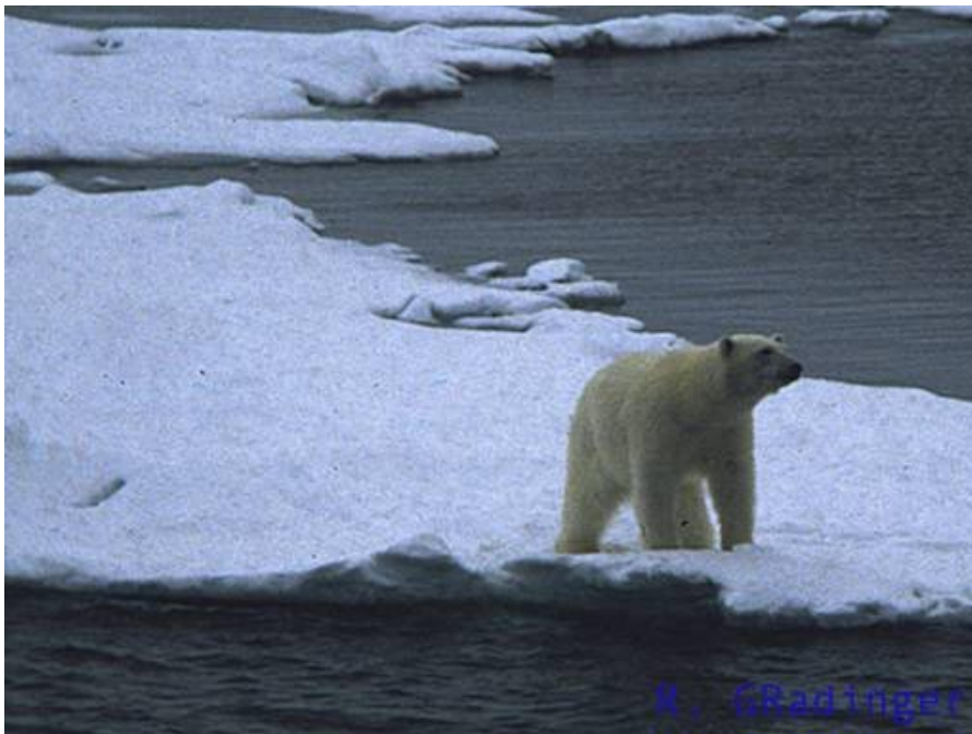
Sea ice is an important platform for many polar marine vertebrates. Polar bears use sea ice for migration and hunting. Bears are also excellent swimmer, and dive for several minutes at a time.