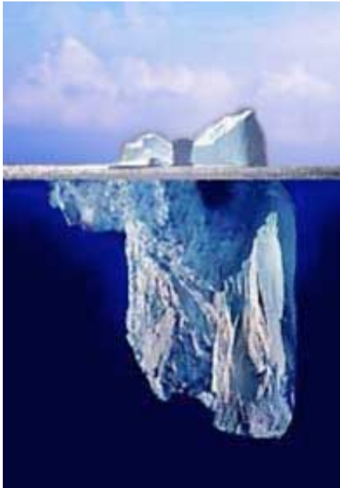
View of Sea Ice if you could see it throughout the water column.