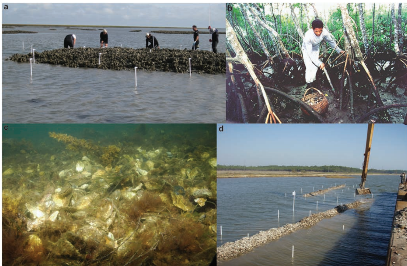
Figure 3. Oyster ecosystem services. (a) Light sensors deployed at low tide to measure filtration and changes in water clarity over a restored oyster reef in Virginia. (b) Oysters being gathered in a mangrove forest in Brazil. (c) Oyster reef restoration in progress to measure shoreline protection in Alabama. (d) Habitat provided by the Australian flat oyster in Tasmania, Australia.

and sport fisheries (e.g., Lipton 2004). Although there is increasing recognition that shellfish provide multiple ecosystem services, management for objectives beyond harvest has not yet become widespread.