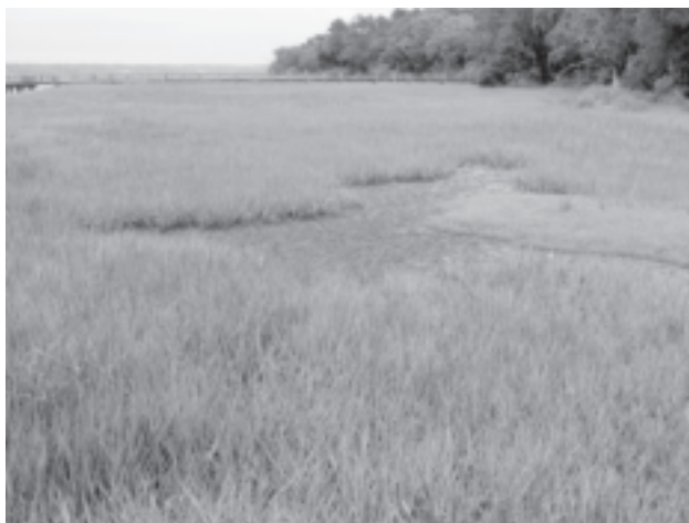
This shows a marsh die-back site.